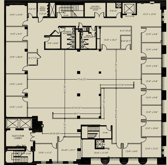
SUITE 300 - FLOOR PLAN

All above space can be divided or are contiguous.